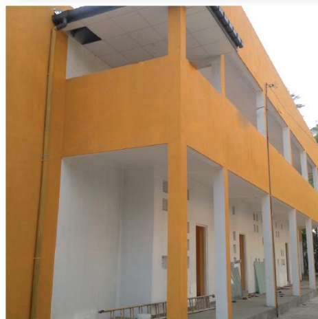
Photo above: the old children's home Photo below: the new children's home